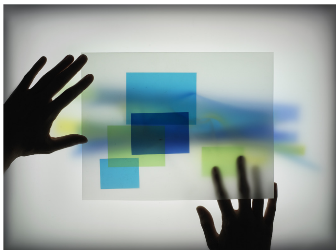
L'apprentie 3 , 2008, Collection of the artist

If Manon De Pauw explores the appearing of the image – with its measure of unpredictability, suspended materiality, narrative potential and motion – it is because much of her work is produced in the darkroom or the shadows of the studio. She has the ability to latch onto this fragile breath of the image as it emerges under the effect of light, recording its luminous fluidity to create the tangible body of the image that asserts itself before our eyes.