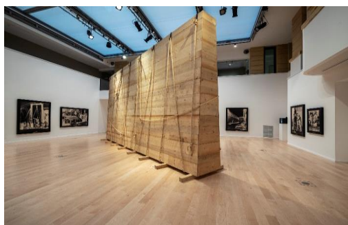
View of the installation Monuments II at the exhibition Displacements , Canadian Cultural Centre, 2019.

Organized in partnership with the Canadian Cultural Centre in Paris , the exhibition will allow visitors to reflect on what works of art mean to them. What are we prepared to do to protect our masterpieces in times of war, crisis, repression and attacks on freedom of expression?