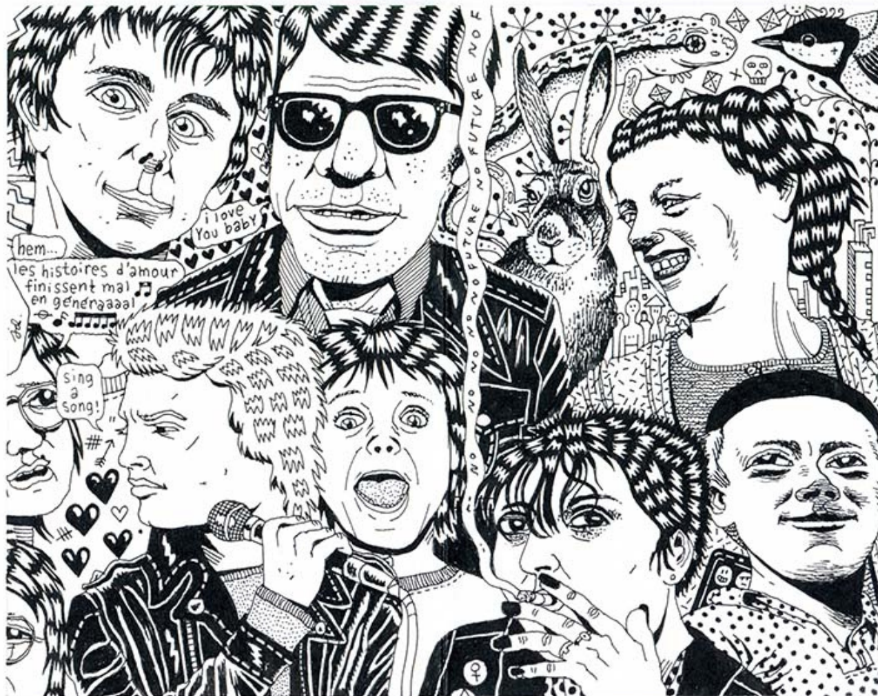
Julie Doucet sing a song!, 2023 black ink on paper 14 x 18 cm