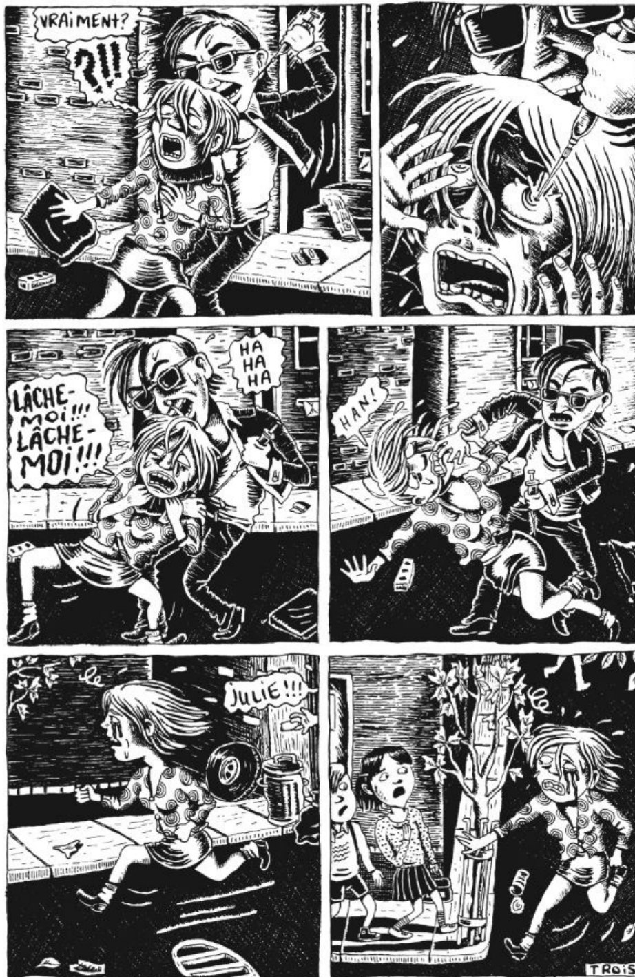
Julie Doucet La seringue / The Syringe , 1990 strip 3 black ink on paper