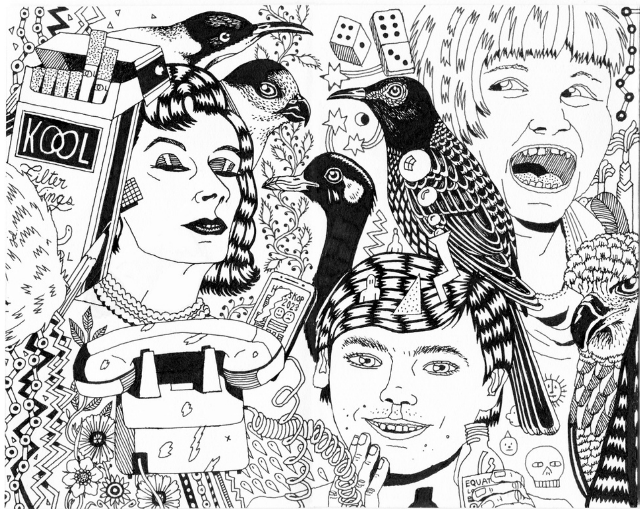
Julie Doucet horoscop, 2023 black ink on paper 14 x 18 cm