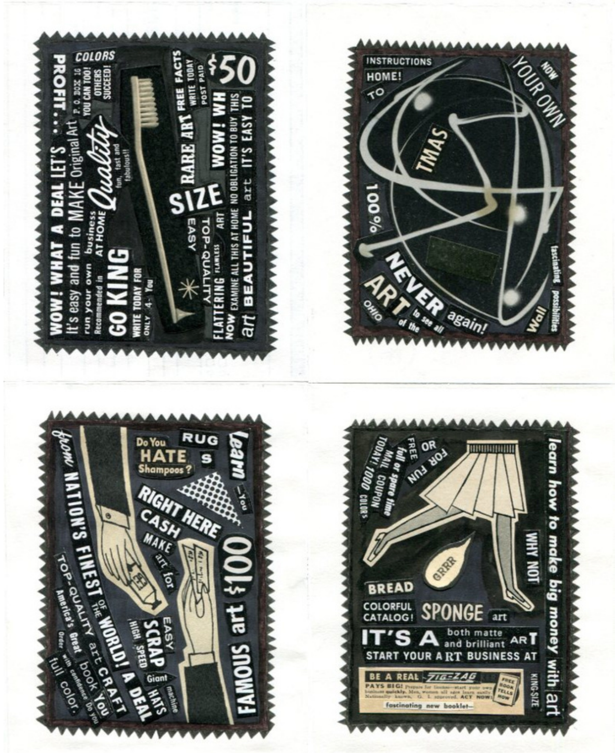
Julie Doucet art scrap craft, 2023 collage