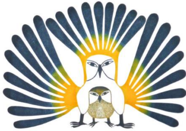
Kanngait Ashewik, Le retour du soleil/Return of the Sun, 1993, Collection Claude Baud et Michel Jacot/Claude Baud and Michel Jacot Collection © WBEC, Kinngait, Nunavut

Canadian Cultural Center, Embassy of Canada, 130 rue du Faubourg St Honoré, Paris 8 e , from October 2 (weekdays) 10 am to 6 pm